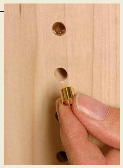
Sleeve adds refinement and strength. You can improve both the appearance and strength of a shelf pin simply by slipping a brass sleeve into the pin hole.

Shelf pins come in a wide variety of shapes, sizes, materials, and finishes. My favorites are the machined solid brass ones from Lee Valley. I also like the very small round pins by Häfele for smaller cases. Shelf pins also come with special clips for securing the shelves or for holding glass shelves. Sleeves are a great way to recover from poorly drilled holes. Stamped sleeves (short tubes with a flared and roundedover end) tend to look like shoelace eyelets when installed in a cabinet. Solid brass machined sleeves look better, even though they accentuate the row of holes in the case sides somewhat. Some sleeves are threaded for specially threaded shelf pins.