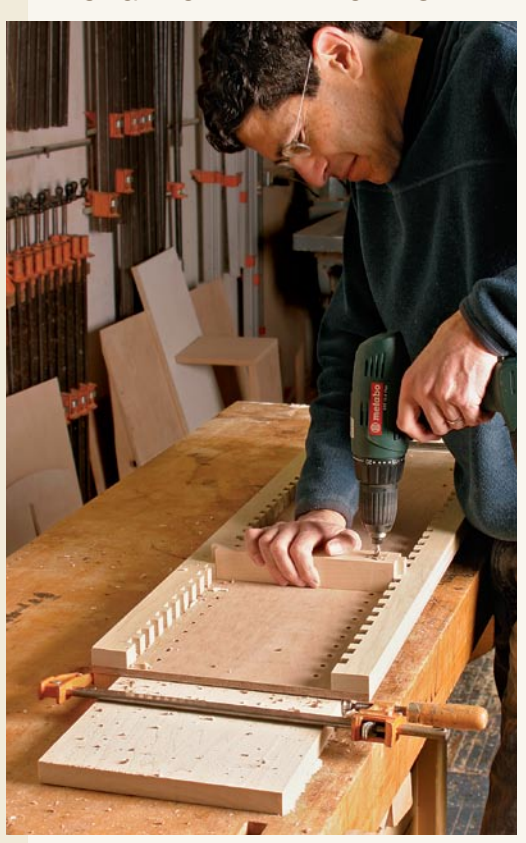
Shelf-pin holes in a jiffy. Thanks to this shopmade jig, Miller quickly drills shelf-pin holes that are the same depth and perfectly spaced.