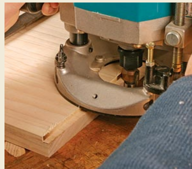
Mark and cut the rabbet. First, mark the rabbet location on the end of the shelf (left), then use a bearing-guided rabbeting bit to cut the rabbet (above).