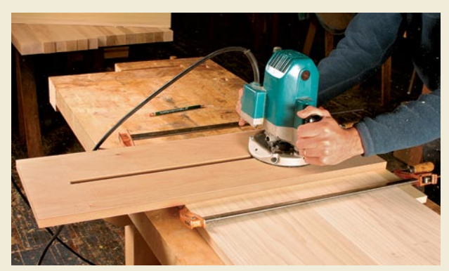
Rabbeted dado starts with a dado. A T-square jig helps cut a dado across the side. The slot in the jig is just wide enough to accept the bearing of a top-mounted bearing-guided straight bit.