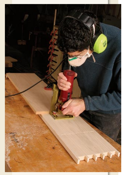
Clamp and cut. Clamp the jig to the case. Cut one set of slots, then use the jig to cut the same slots on the other side. Crosscut the fence to the next shelf position, and repeat until all slots are cut.

A jig for cutting slots in the sides makes it easy to locate shelves accurately. The jig has just two parts: a cleat and a fence. The cleat keeps the end of the fence square to the side. Centerlines for the slots are marked on the end of the fence. With each new set of shelf slots, the fence is crosscut to a shorter length. Toss the jig when done.